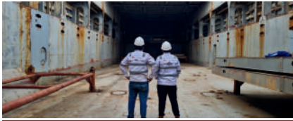
PROTECTION AND INDEMNITY (P&I)