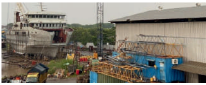
SHIP REPAIR'S LIABILITY (SRL)