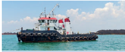
HULL & MACHINERY (H&M)