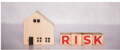
PROPERTY ALL RISK