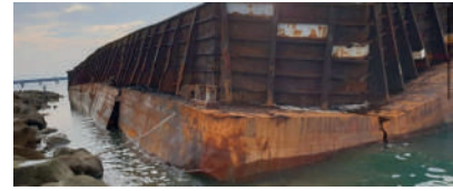
WRECK REMOVAL AND OIL POLLUTION (WROP)